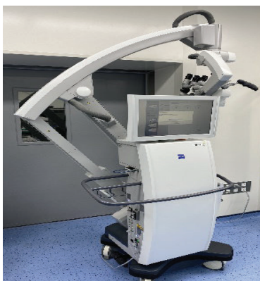
Surgical microscope Pentero P800 - Zeiss.