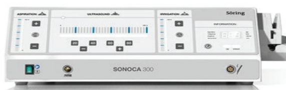
Remove tumor with an ultrasonic SOERING knife.

On MRI, most tumors were hypointense on T1 and hyperintense on T2 (77.8%), with vivid contrast enhancement and dural tail signs appearing.