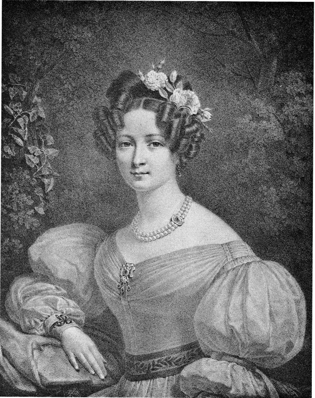
Portrait of Marie Taglioni by Pierre-Roch Vigneron. Paris. 1828. (9)