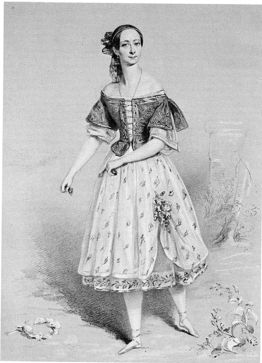
Marie Taglioni in la Gitana . London, 1840. (85)