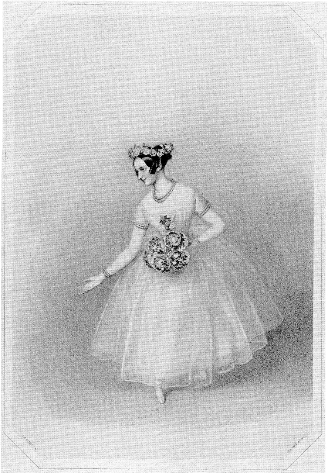
Marie Taglioni in la Sylphide from Chalon's Souvenir d'Adieu . London & Paris, 1845. (126f)