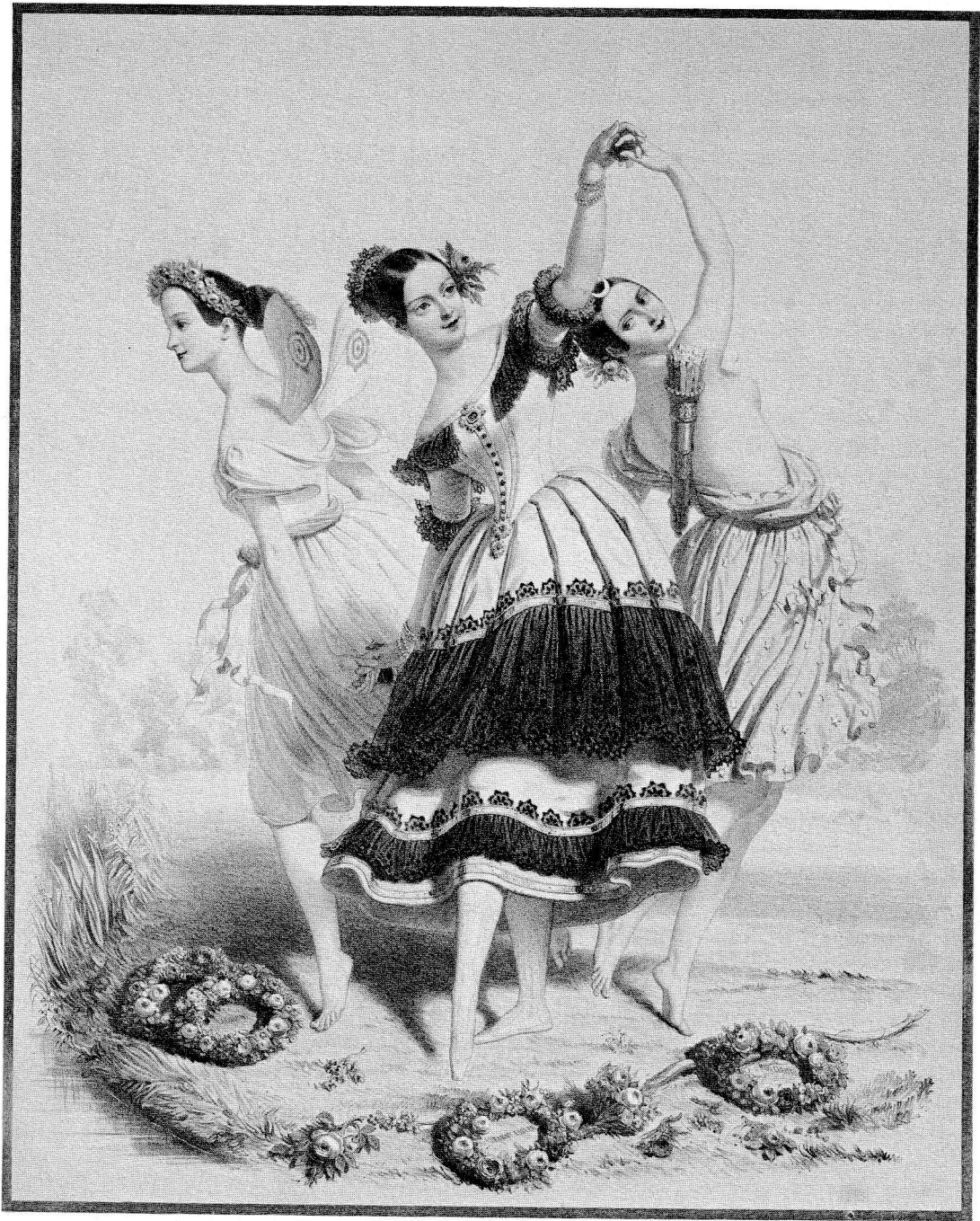
Les Trois Grâces. Paris & London, 1844. (111)