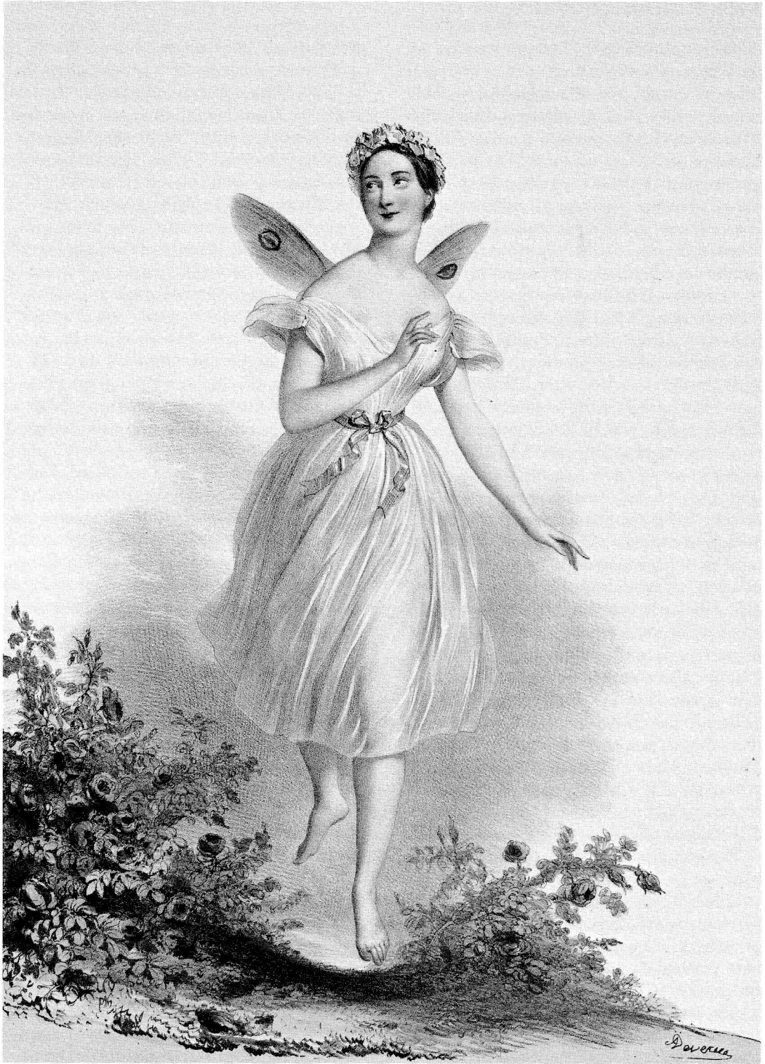
Marie Taglioni in la Sylphide . Paris, [1837]. (55)