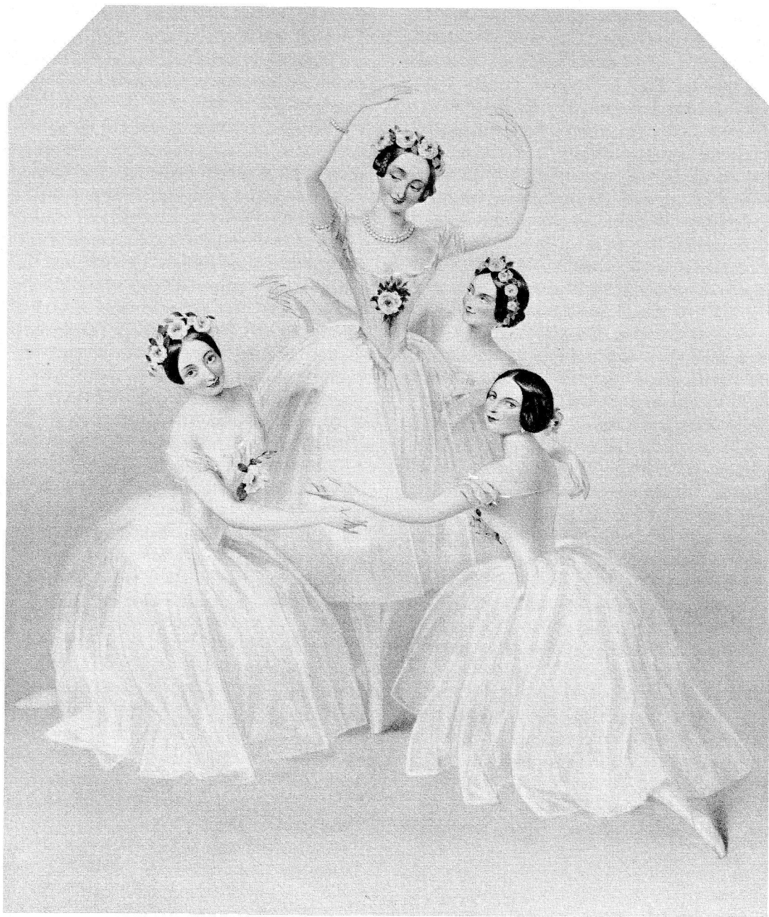
Carlotta Grisi, Marie Taglioni, Lucile Grahn and Fanny Cerrito in the Pas de Quatre . London & Paris, 1845. (124)