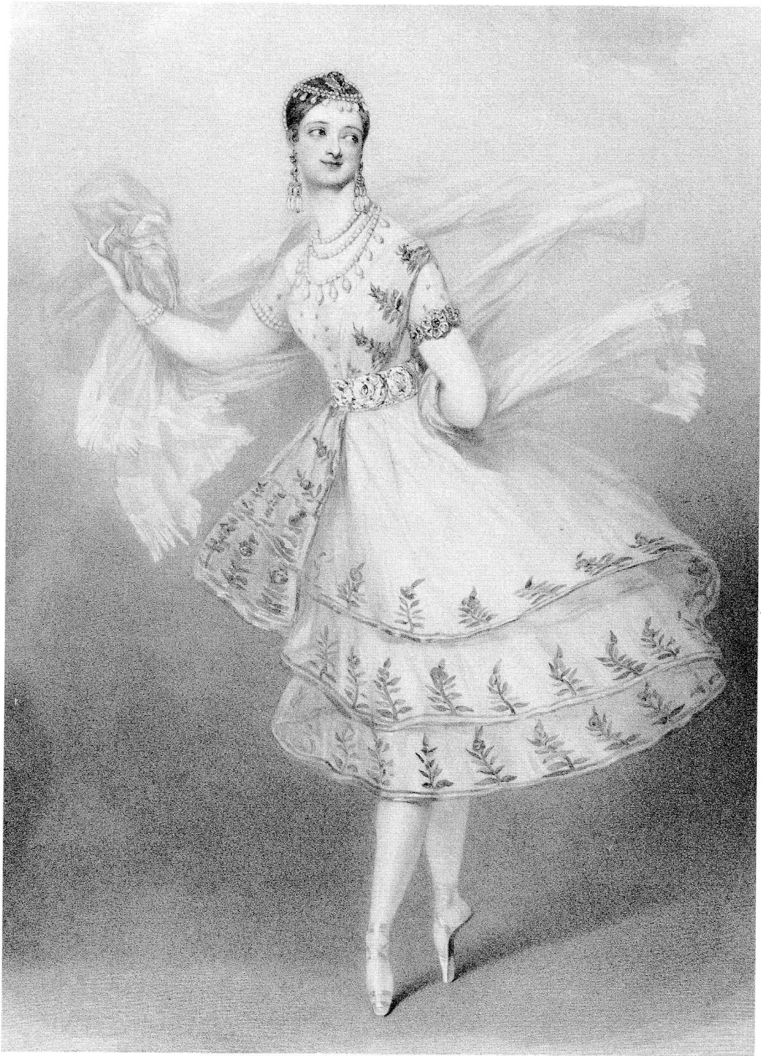
Marie Taglioni in la Bayadère . London & Paris, [c. 1834-35]. (27)