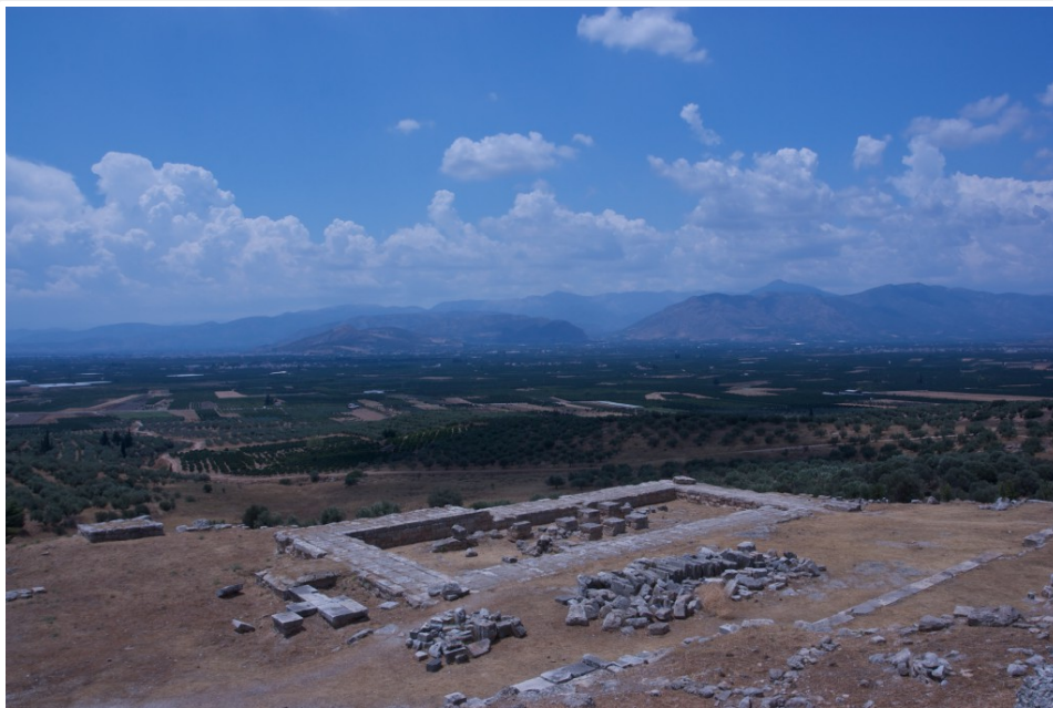
Looking over the Hēraion south-southwest toward Argos

§1. In H24H 13§§11–22 (see also 11§17), I quote and analyze the narrative in Herodotus 1.31.1–5 [Greek | English] about two young men named Kleobis and Biton who pulled the wagon that carried their mother, priestess of the goddess Hērā, in a sacred procession that started at the city of Argos and reached its climax at the heights [...]