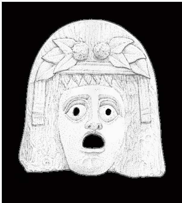
Mask of Dionysus, found in Myrina (now in Turkey). Terracotta. 2nd–1st centuries BCE. Paris. Musée du Louvre. Department of Greek, Etruscan and Roman Antiquities (Myr. 347). Line drawing by Valerie Woelfel.

I challenge myself here to write up seven elementary “plot outlines”—I call them overviews—for seven Greek tragedies: (1) Agamemnon and (2) Libation-Bearers and (3) Eumenides, by Aeschylus; (4) Oedipus at Colonus and (5) Oedipus Tyrannus, by Sophocles; (6) Hippolytus and (7) Bacchae (or Bacchic Women), by Euripides. In my overviews, I expect of the reader no previous knowledge of these seven tragedies.