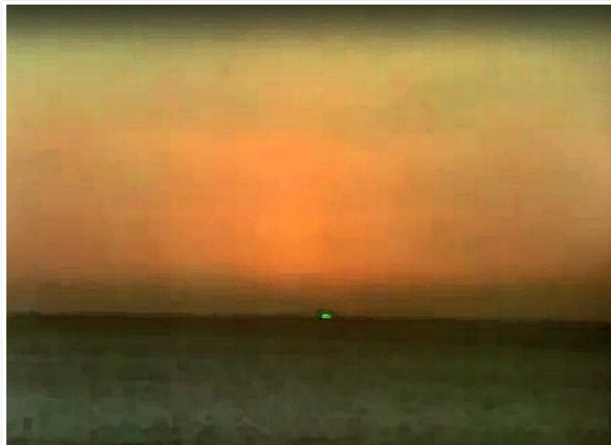
After Le Rayon Vert , directed by Éric Rohmer (1986): the green ray at sunset.