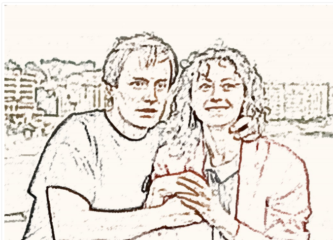
After Le Rayon Vert , directed by Éric Rohmer (1986): Jacques and Delphine before the green ray.

§0. It is summer. A young woman and a young man are sitting side by side at a beachfront, looking out toward the vast sea that is facing them. They aim their gaze westward, viewing what seems like an infinite stretch of water that reaches all the way to the darkening horizon where the sea finally meets an infinite sky. As they watch the sun sink slowly into the sea, the young woman starts weeping. Then, suddenly, at the very moment when the glowing orb finally goes under, it gives off a subtle green flash. This is the green ray, which is a literal translation of the French words le rayon vert . The moment I am describing takes place in a film directed by Éric Rohmer , which actually bears the title Le Rayon Vert . It originally appeared in 1986. But Le Rayon-Vert is also the title of a romantic novel by Jules Verne, which appeared over a century earlier, in 1882. The novel was in fact the original inspiration for the film, though the stories differ radically. In the film, the story ends on a seemingly happy note: once she sees the green ray, the young woman who was weeping a moment earlier is now smiling as she cries out: oui ! But the happiness of this moment marked by the outcry of 'yes!' is not what interests me the most in this film: rather, I will highlight the earlier moment of weeping.