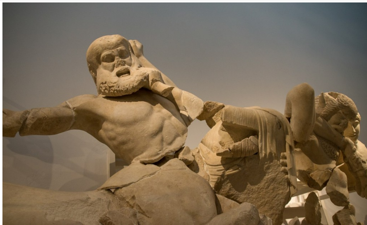
West pediment of the temple of Zeus in Olympia.

§0. This posting, written 2019.04.19, picks up from where I left off in Classical Inquiries 2019.03.22 , rewritten 2019.04.17 . In the last paragraph of that posting, I focused on a myth that told about a defeat of the Centaurs, beastly hominoids who were half horse, half man. Such a mythological event is pictured in the sculptures of the west pediment of the temple of Zeus in Olympia, created around the middle of the fifth century BCE. And I have a basic question to ask about the picturing of this event: in our own reading, as it were, of the pedimental sculptures, who exactly were the mythological characters who defeated the Centaurs? In other words, how are we to imagine this primal event?