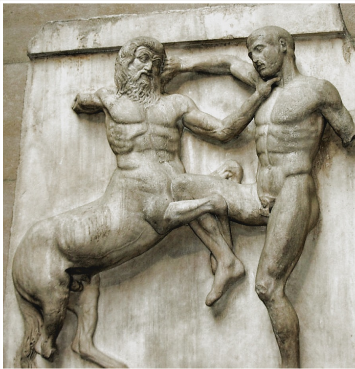
A Lapith and a Centaur. Parthenon, South Metope 31.