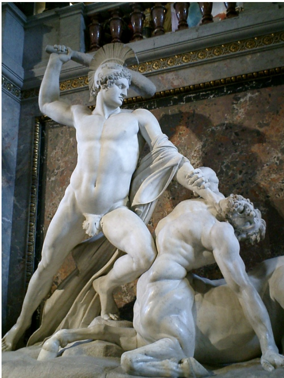
Theseus defeats the Centaur (c. 1805–1819). Antonio Canova (1757–1822).