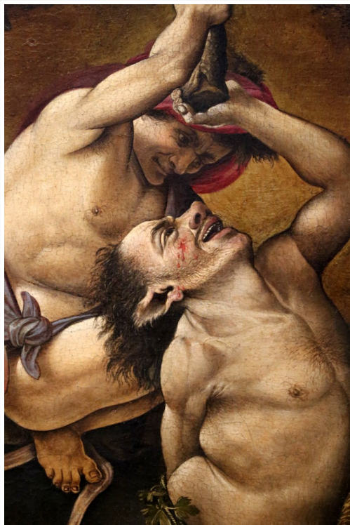
Battle between the Centaurs and Lapiths, detail (c. 1500–1515). Piero di Cosimo (1462–1522). Image via Wikimedia Commons.

§1. In my earlier posting, I had highlighted some of the inconsistencies that impede the expert efforts of today's archaeologists and classicists to reconstruct the content of the myth that we see being pictured in the sculptures of the west pediment. I contrasted such inconsistencies with a relatively more consistent interpretation provided by the ancient traveler Pausanias. Unlike today's experts, who are forced to work with mere fragments of an original ensemble, Pausanias had the good fortune of viewing the pedimental sculptures in their totality when he visited the temple of Zeus in Olympia around the middle of the second century CE. In the present posting, I argue briefly that this ancient traveler, by way of his own reading of the pedimental sculptures, is a most valuable source for understanding the myth about the Centaurs as