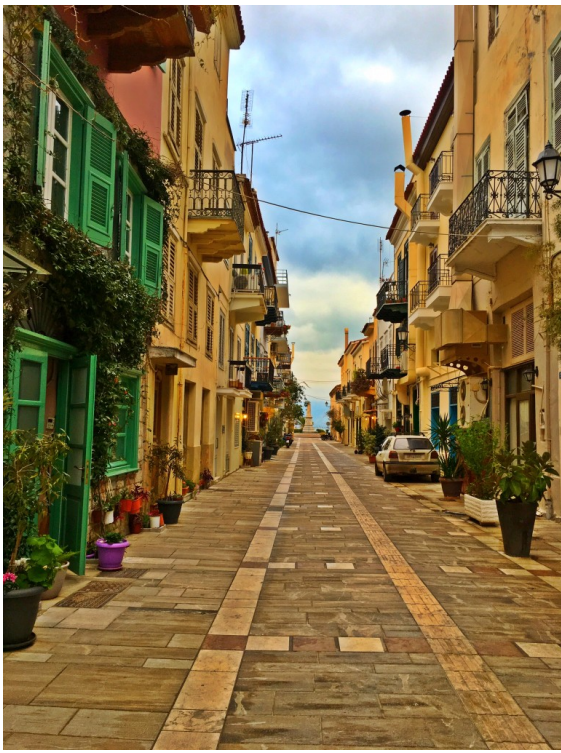
View of Othonos Street, Nafplio.