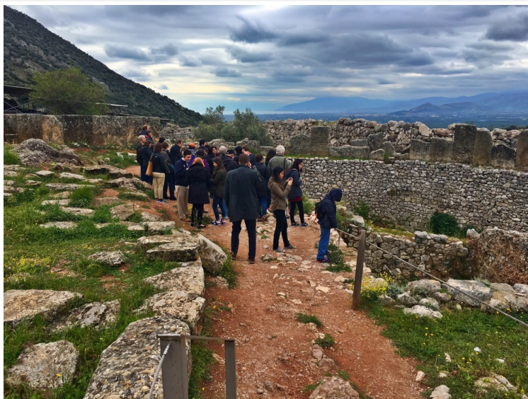
Grave Circle A (to the right), Mycenae, with plain of Argos in the distance.