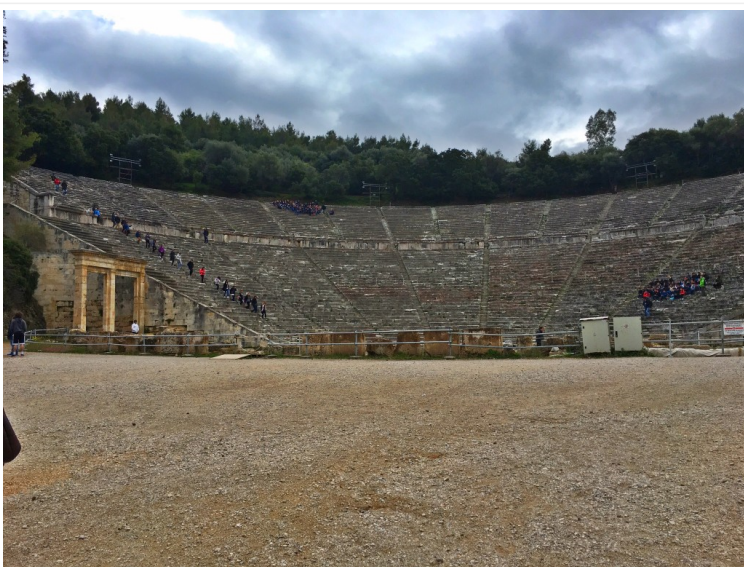
Theater at Epidaurus.

§9.1.B The Tholos . Pausanias has this to say about it: