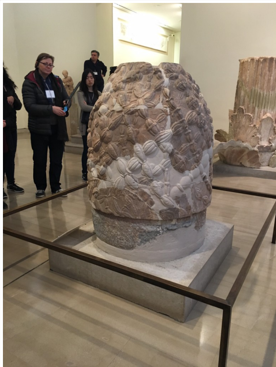
The Omphalos or Navel of the Earth, Delphi.

§13A. The statues of Kleobis and Biton . In my book The Ancient Greek Hero in 24 Hours 13§§11-22 (see also 11§17 ), I quote and analyze the narrative in Herodotus 1.31.1-5, which ends with the report that the people of Argos commissioned statues of Kleobis and Biton to be set up at Delphi. And that is exactly where the two statues were unearthed in modern times.