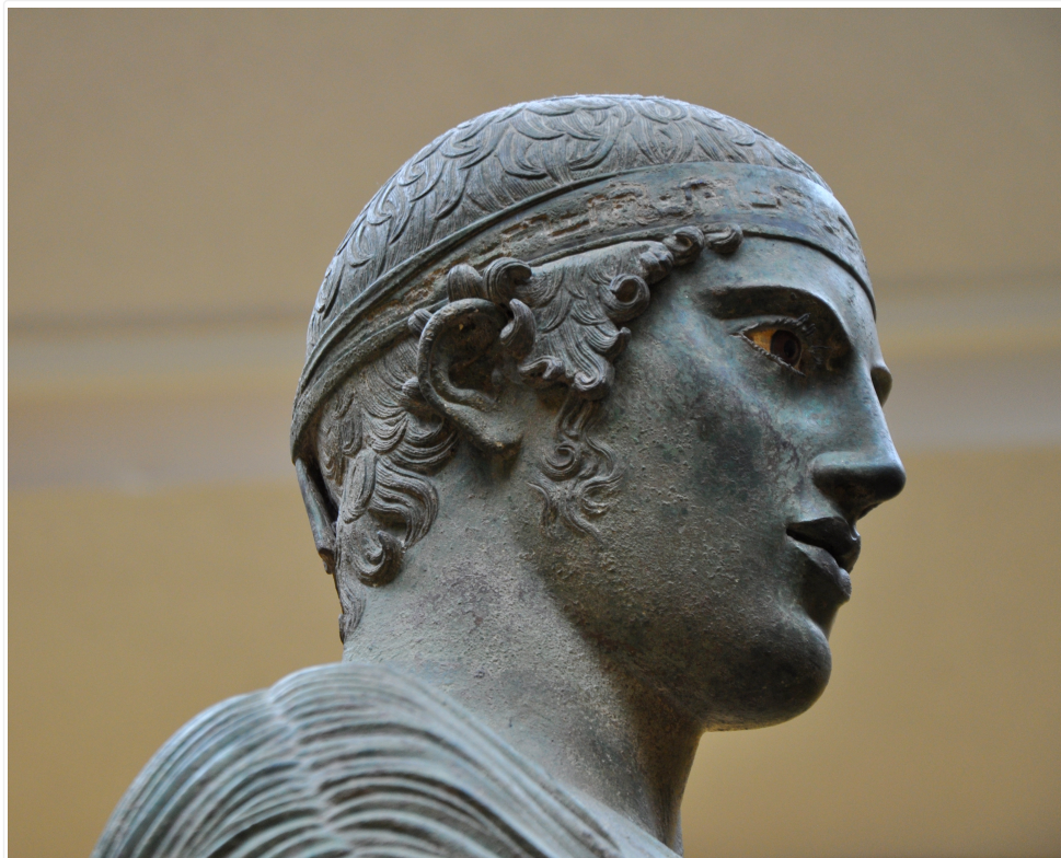
Closeup of the "Charioteer of Delphi." Greek bronze, ca. 470s BCE.

During the five full days of contact time for myself and the participants of the 2016 Harvard Spring Break travel-study program, I tried each day to focus on three things to see at each ancient site we visited. Wherever it was possible, I used as my primary ancient source the reportage of the ancient traveler Pausanias, who flourished in the second century CE and whose Greek text is translated into English at a site entitled A Pausanias Reader in Progress . [ full article here ]