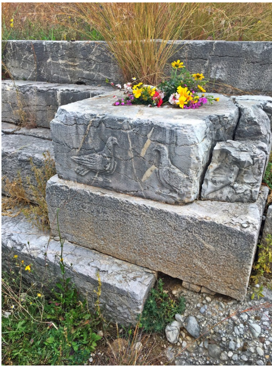
At the sacred space of Hērā.