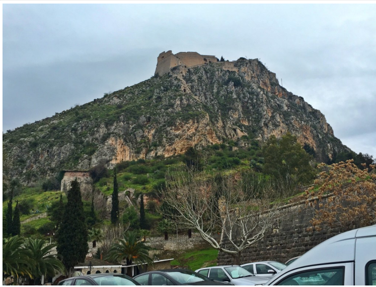
View of Palamidi fortress, Nafplio.