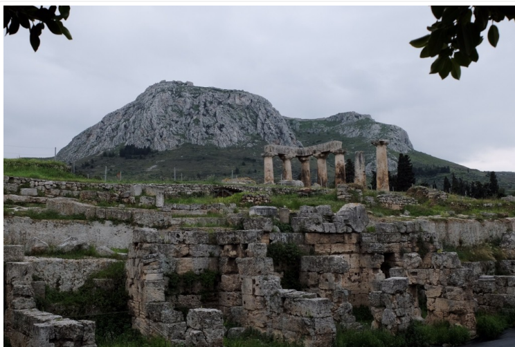
View of Acrocorinth from the spring of Peirene, with the Temple of Apollo in the foreground.

§10.1.B Viewing at ground level the Acrocorinth looming above us. This view is relevant to what follows.