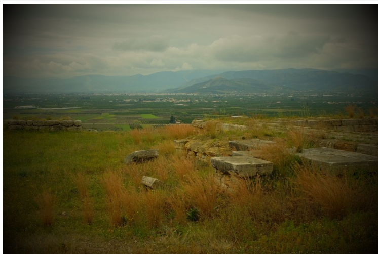
Foundations of the classical temple of Hērā, with the plain of Argos in the distance.

§6.1B. The plain of Argos , as you look down from the elevation where the classical temple was situated.