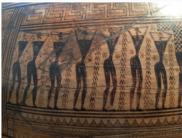
Dipylon Amphora.

§5.1A. In a vast hall straight ahead as you enter, which houses Mycenaean and Minoan antiquities, we find at the further end of this hall a horizontal display case containing seals and sealings. One seal, found in a Mycenaean tholos tomb at Vapheio near Sparta, shows the image of a man in a long robe who is carrying a fenestrated axe (CMS I.225). This axe is shaped like a capital P with a vertical bar bisecting the semicircle attached to the straight line of the P. In a vertical display case nearby—it is to our right as we face the two posts from the “Treasury of Atreus”—we actually see the fenestrated axe (National Archaeological Museum inventory no. 1870): this object had been buried together with the seal that shows the picture of the man carrying the axe. And the man who is pictured on the seal is the same man who had been buried in the tomb containing both the axe and the seal that shows the man carrying the axe; in fact, the seal was attached to the man’s wrist (Yasur-Landau 2015:141). It has been observed about this axe that, by the time it was buried with its owner in the Mycenaean tomb at Vapheio, it was already “a centuries-old ceremonial weapon,” dating as far back as sometime between the 20th and 18th centuries BCE (Yasur-Landau pp. 139, 146); both the axe and the seal had been acquired from Minoan Crete (Yasur-Landau p. 141).