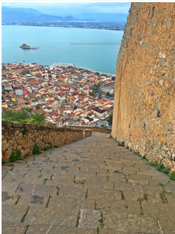
Some of the 999 steps leading up to Palamidi fortress, Nafplio.