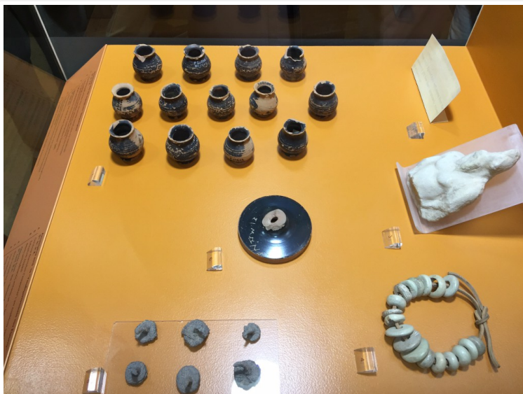
Vials now housed in the Agora Museum, which archaeologists believe contained hemlock.