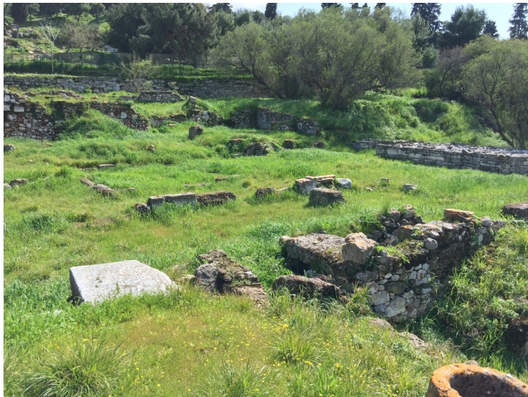
Foundations of the Athenian State Prison where Socrates died.

§2.1C. The place where Socrates was forced to drink the hemlock in 399 BCE. I return to what I said about this place in a posting from 2015.03.27 , entitled "The last words of Socrates at the place where he died," which was composed almost exactly one year ago.