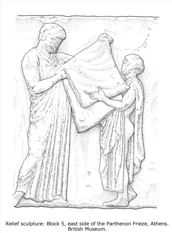
Relief sculpture: Block 5, east side of the Parthenon Frieze, Athens. British Museum.

climax of the procession. That Peplos is the folded robe that we see pictured in the relief sculptures of Block 5 of the east side of the Parthenon Frieze. In terms of my argumentation, this robe is the one and the same sacred Peplos of Athena. Here is a line drawing of the scene: