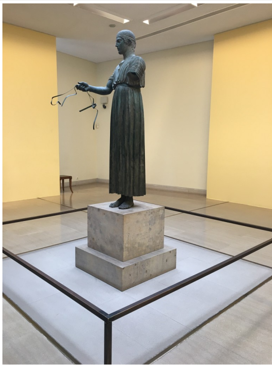
Charioteer, Delphi.