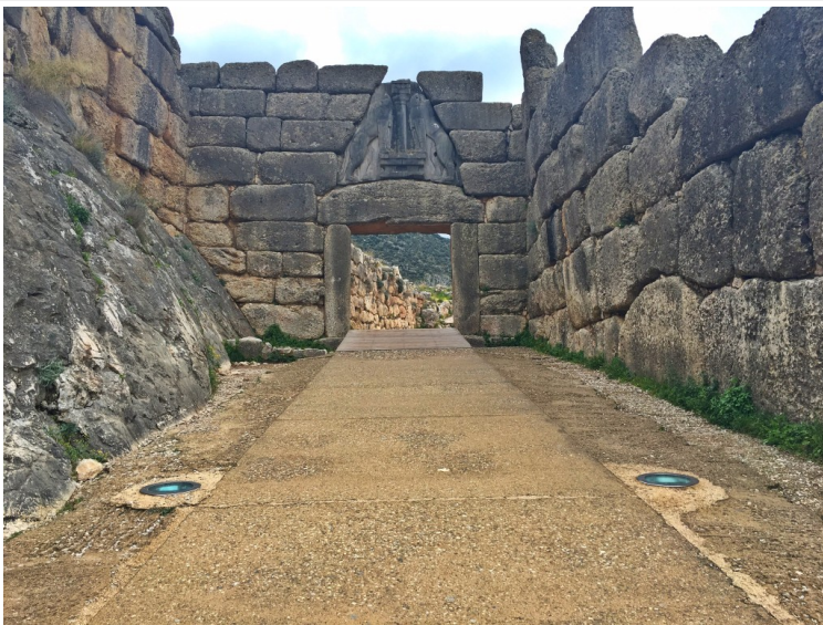
Lion gate, Mycenae.

§7.1B The Lion Gate , leading up to the top of the citadel.