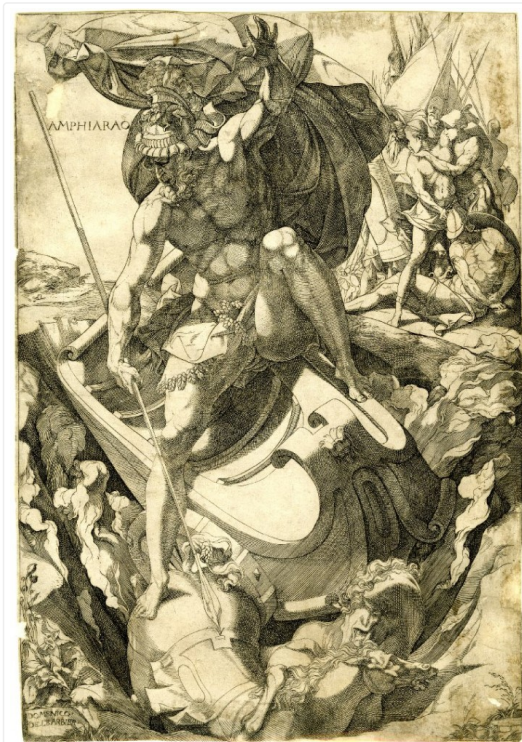
Amphiaraos on his chariot, swallowed up in the earth; in the background, a group of wounded soldiers (ca. 1540/1550). Domenico del Barbieri (French, 1506–1570).

According to the myth, Amphiaraos was fleeing from Thebes after the expedition of the Seven had failed, driving his chariot across a plain, when, suddenly, the earth opened up and swallowed him together with the chariot drawn by his speeding horses. This mystical moment of the hero's engulfment by Mother Earth has captivated artists both ancient and modern, and I show an example here. As Pausanias observes, however, there were different traditions about locating the actual place where Amphiaraos was engulfed. This observation about ongoing disagreement over the place where the primal scene of the hero's engulfment actually happened is what I mark here as a placeholder for further commentary on further passages where Pausanias refers to the hero cult of Amphiaraos.