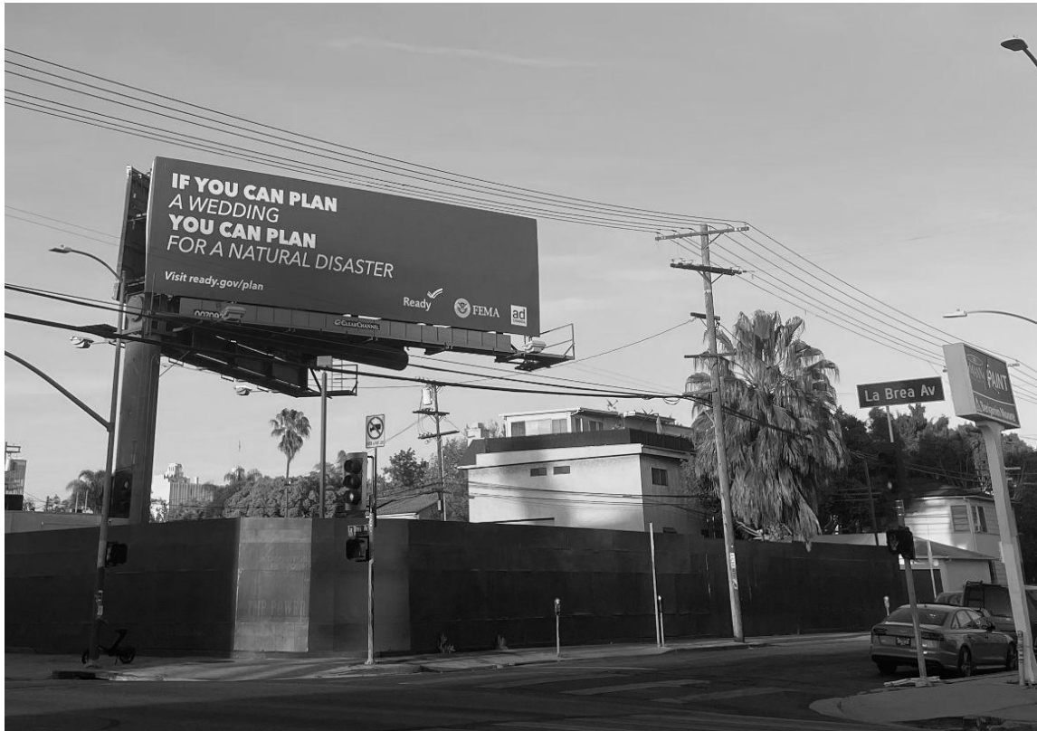
Billboard along La Brea Avenue in West Hollywood, March 2022.

How disaster preparedness and recovery efforts in the United States fail renter communities, and what strategies could improve risk mitigation for non-homeowners.