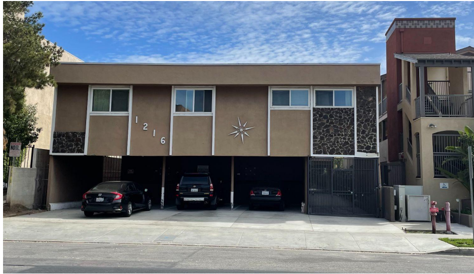
A typical West Hollywood 'dingbat' apartment building.

As opposed to the region surrounding West Hollywood, multi-family housing stock is much more prevalent. A primary rental building typology in the area is the soft-story “dingbat” building, a two-story multi-family walk-up apartment building containing 6-12 apartments and tuck-under parking commonly built before 1980. 115 Though the origins of the term are murky, the name ‘dingbat’ gained widespread recognition through Reynar Banham’s study Los Angeles: The Architecture of Four Ecologies . Within this catalog of the built environment of Los Angeles, Banham defines the dingbat as “simple rectangular forms and flush smooth surfaces, skinny steel columns and simple boxed balconies, and extensive overhangs to shelter four or five cars.” The front cladding acted as “a commercial pitch and a statement about the