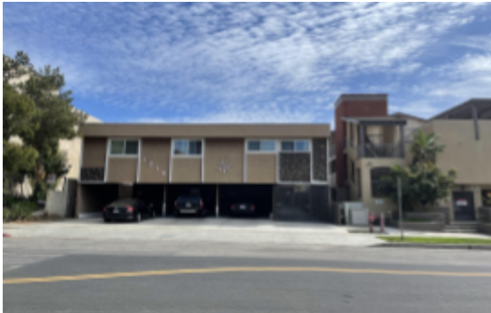
EXHIBIT 4: PHOTOGRAPHS OF WEST HOLLYWOOD DINGBAT TYPOLOGIES