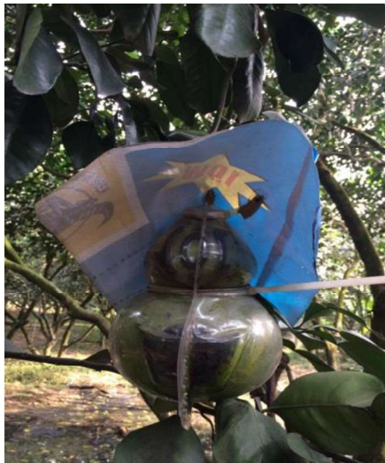
Figure 6. Pomelo with unique design