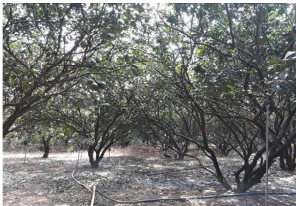
Figure 2. Pomelo garden in Tan Trieu Islet