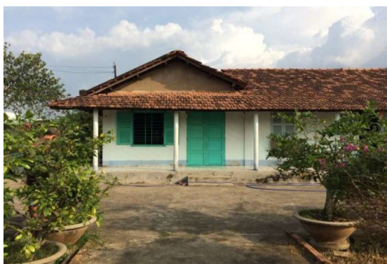
Figure 4. Local house at Tan Trieu Islet

but still spend time to take care of the family pomelo garden. The first group is the original farmers, whose gardening is the main economic activity. Basically, almost they have specialist knowledge in planting and caring the crops. Thanks to the application of scientific and technical progress, the harvest is usually success. One hundred percent of pomelo farmers set up automatic irrigation systems that are convenient, quick and labor saving. Typically, Ngo Van Son is one of the best farmers in the locality. He has