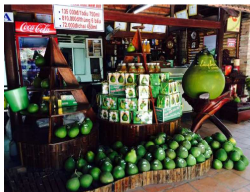
Figure 5. Pomelos decoration at local house

started to grow and develop pomelo orchards since 2000, which has become one of the largest areas of pomelo garden (2ha) and the most beautiful in Tan Trieu. By grinding researching, and seriously investment he produces repeatedly the quality Viet Gap standard pomelo. In particular, he is famous as the first to shape pomelo into unique designs such as the gourd, the coin or printed images on the fruit peel (the “Treasury” letter, the “Fortune” letter, Vietnam map, etc.) for distillation during Tet occasion (Figure 6, Figure 7).