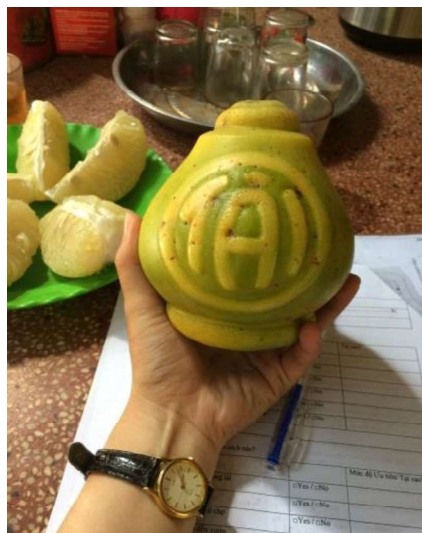
Figure 7. Pomelo with unique design