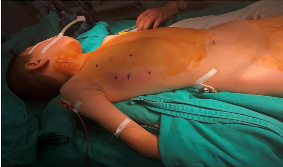
Figure 1: Prepare patient position