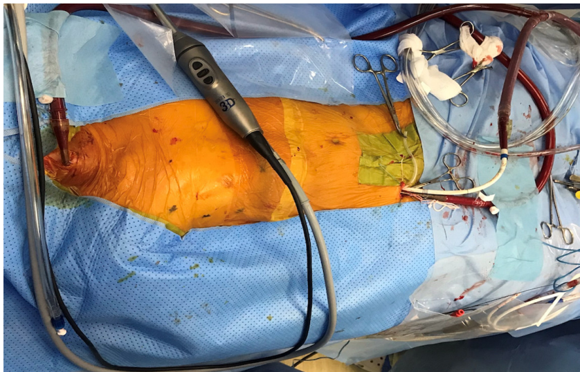
Figure 2: Peripheral cardiopulmonary bypass

We used a systemic doses of heparin 3ml/ kg body weight. We opened a mini incision on the right inguinal fold, revealing common femoral artery and femoral vein (for the inferior vena cava-IVC). SVC was placed through the right IJV with Seldinger technique. We tested the arterial line and the CPB was activated.